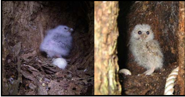
Fig. 11a. Collared Scops Owl chick after being returned to its nest in Sai Kung. Fig. 11b. The same owl chick, two weeks later.

In June 2005, WARC staff were called on a number of occasions to deal with bats that had apparently been washed out of their roof roosts during heavy rain. A bat box was produced and erected near to the roost site to help place bats back in a dry environment. This had limited success, as some bats were young and were not being cared for by adults. It would be interesting to know how widespread this phenomenon is during torrential rain.